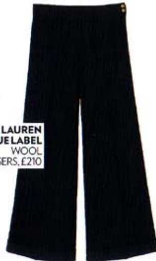
RALPH LAUREN BLUE LABEL WOOL TROUSERS, £210

TIPS: "Tuck tops into wide-leg trousers; high heels are vital."