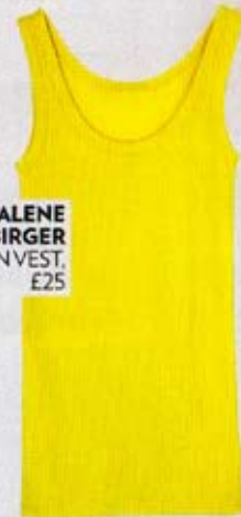
MARLENE BIRGER COTTON VEST, £25

TIPS: "Wear bright colours with white or neutrals to keep the look fresh and modern."